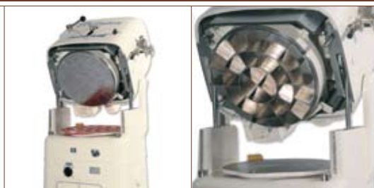
Dividing plate with dividing knives